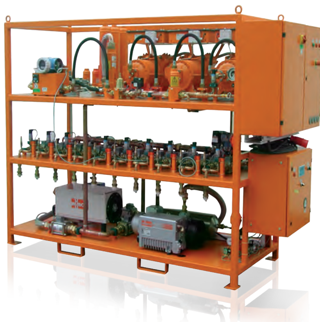
Powerful stand alone unit with 10 parallel ports for evacuating air, filling the gas chamber and recovery of SF 6 gas.