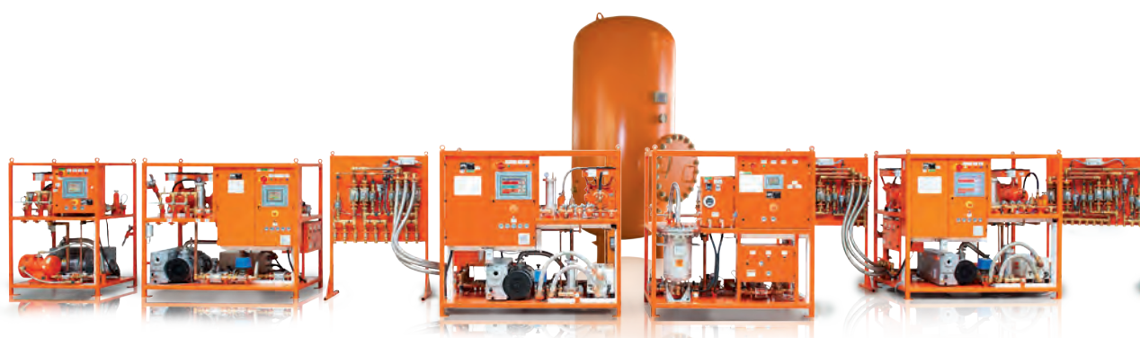
Complete line solution with central unit, storage tank and several work stations.

For switchgear production DILO offers two solutions: The stand alone unit and the complete line solution for an SF 6 network for punctual gas handling of the test stations of the produced GIS units. Thus building up a production line can easily be achieved.