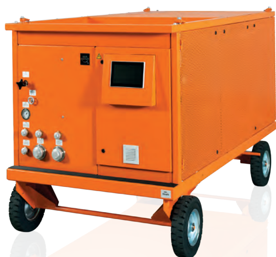
L600 with sheet metal covering available as option

All types are available with additional connecting couplings DN20 and DN40 (as option) for simultaneous operation. Thus it is possible to evacuate air from a gas compartment while filling SF 6 at the same time or recovering gas from another gas compartment. Multitasking in practice.